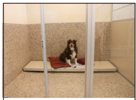
SUITE 6' X 8' space 5 Suites Available $34/night