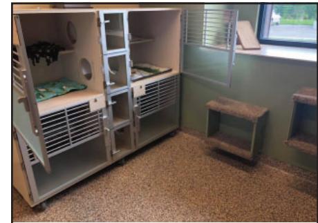
CAT BOARDING 4 Kennels Available $20/night