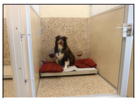
STANDARD 4' x 6' space 10 Standard Kennels Available $27/night

Discounted rates are available for additional pets staying in the same kennels or pets staying 30 days or more. Holiday and seasonal rates vary.